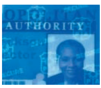
FARGO's innovative SmartShield technology prints reflective, ultra-violet images which enhance card security and discourage counterfeiting.