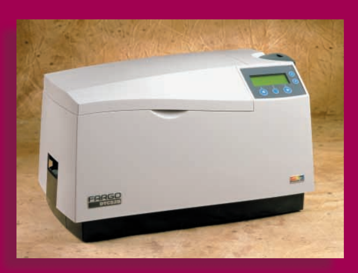
Revolutionary Card Printers With All New Features