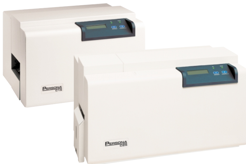
The Persona C15 and Persona C25 Desktop Card Printers

Print some personality into your cards with Persona!